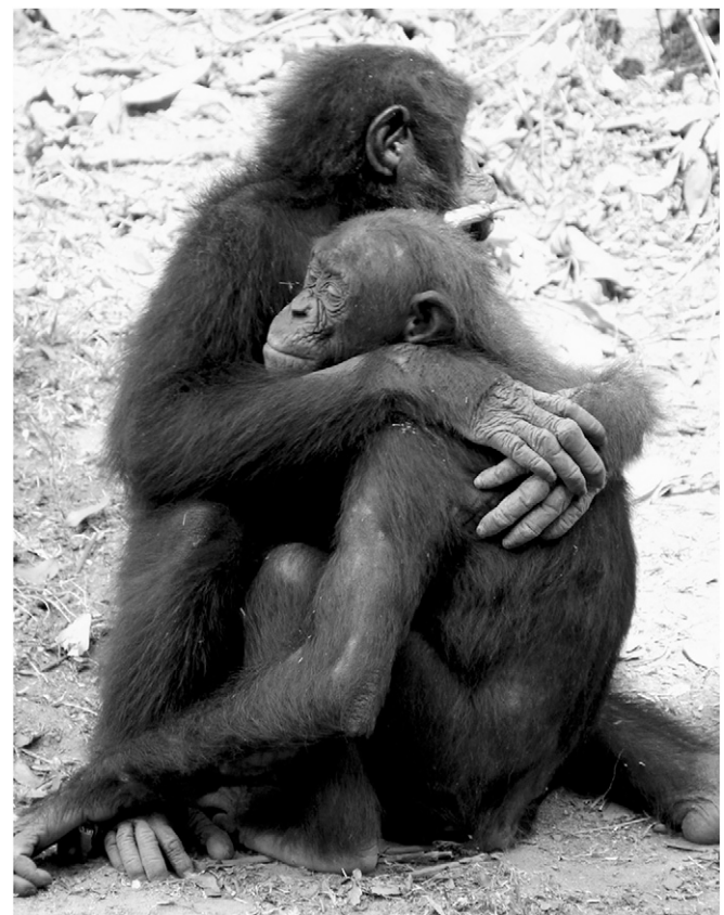
Fig. 1. One juvenile bonobo embraces a distressed companion during postconflict consolation. at the Lola ya Bonobo Sanctuary in the Democratic Republic of the Congo.

Juvenile bonobos with signs of better social and emotional competence were more likely to respond to the distress of others by offering consolation. There was a direct positive correlation between how juveniles handled their own distress events as victims and how they responded to distress witnessed in others: individuals quicker to recover from their own distress as victims were more likely to provide bodily comfort to others. Individuals with higher sociality (expressed in the CSI, a marker of overall social competence) were most likely to offer consolation and approach victims rather than fleeing (expressed in the PRI). In agreement with human infant studies (45, 47), sociality was the best predictor of consolation behavior. Consistent with empathy-